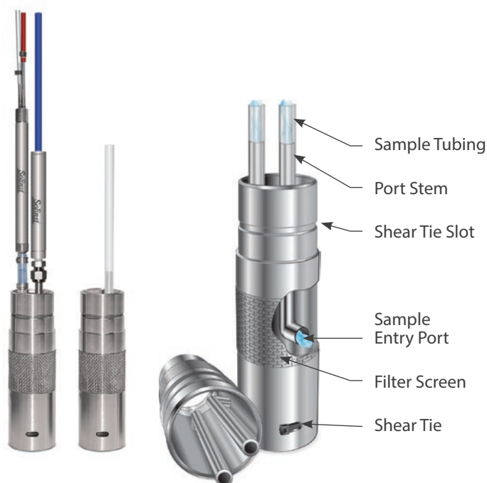
Stainless Steel Ports