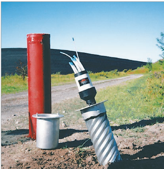
An investigation of hydraulic properties beneath a large waste site. Waterloo Multilevel Systems were chosen to allow water quality sampling and to help determine the zones of highest permeability within the aquifer.