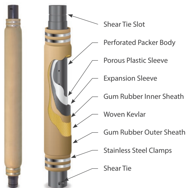
Permanent Waterloo Packer