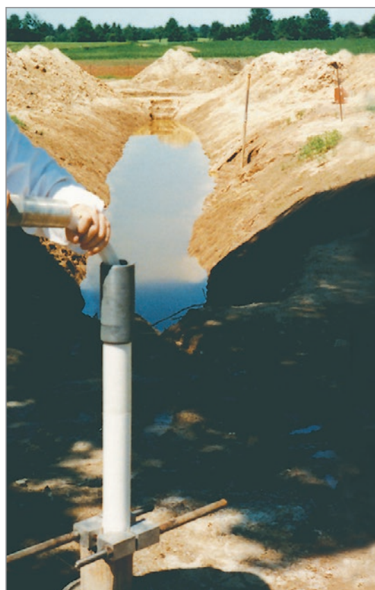
Underground oil pipeline leak assessment. Three 150 ft. (45 m) installations. Two point rising head permeability tests were conducted in each interval of the Multilevel System. (See diagram showing contaminant distribution at left.)