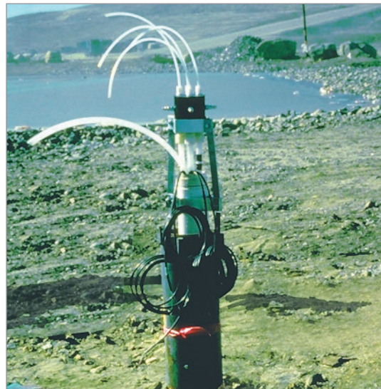
Landfill site over fractured granite, monitored with five Waterloo Systems. Each System comprised of dedicated Double Valve Pumps and Pressure Transducers in 4-6 intervals to depths of 275 feet (84 m). The Multi-Purge Manifold allowed the monitoring of 21 zones to be completed in less than 2 days.