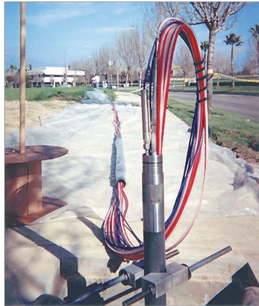
Contaminant investigation at a U.S. Air Force Base. Waterloo Systems installed to 700 ft. in overburden using screened and cased wells. Up to 6 zones per hole with dedicated pumps and transducers.