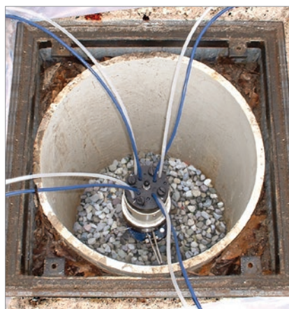
Using core logs to identify placement of Ports and Packers (left). Multi-Purge Manifold with transducers and dedicated pumps for four zone monitoring (right).