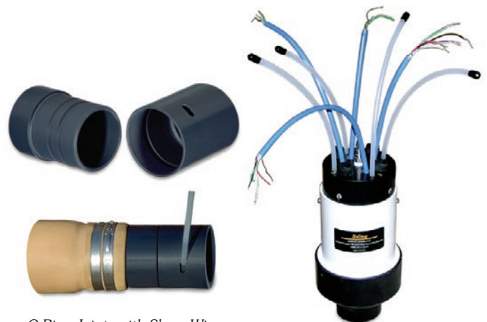
O-Ring Joints with Shear Wire