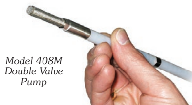
Model 408M Double Valve Pump

Dedicated Bladder and Double Valve Pumps, (DVP), as well as a portable DVP are ideal for use when low flow sampling and purging techniques are desired.