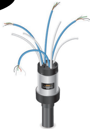
Multi-Purge Manifold Wellhead