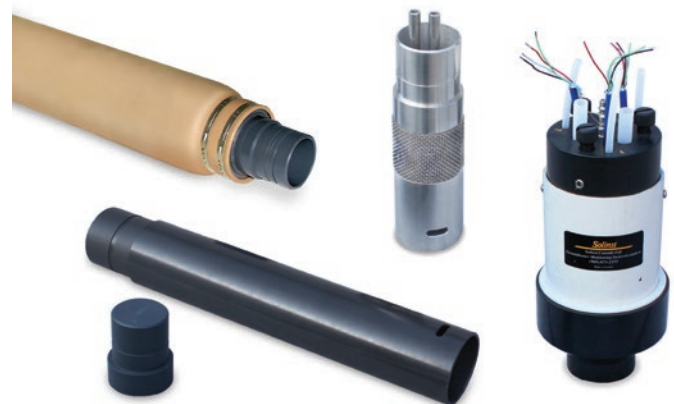
Standard Waterloo System components, including Packer, Port (Dual Stem), PVC Casing, PVC Base Plug, and Manifold.

The manifold allows connection to each dedicated transducer in turn, and a simple, one-step connection for operation of pumps. When dedicated pumps are selected, a unique wellhead allows individual zones to be purged separately, or purging of many zones simultaneously to reduce field times.