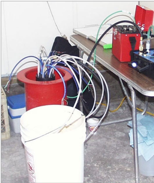
Four Waterloo Systems were installed to monitor a chlorinated compound release. Systems were installed at depths ranging from 430 ft - 750 ft, with most monitoring 7 zones. The Ports were constructed with both Double Valve Pumps and Vibrating Wire Transducers.