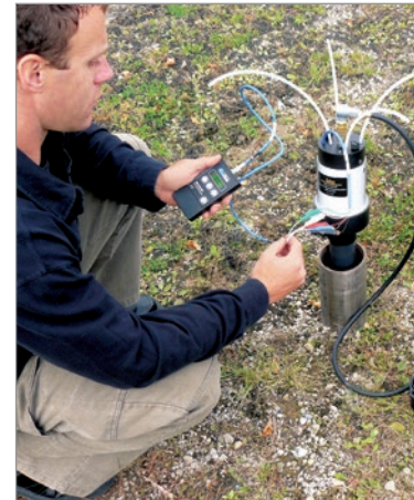
Collecting a sample from a dedicated DVP and taking pressure measurements with Model 404 Geokon Vibrating Wire Readout (above).

The Micro Double Valve Pump (Micro DVP) provides high quality samples, uses coaxial PTFE tubing, and is small enough to fit in 1/2" (13 mm) ID tubing. The unique combination of flexibility and size make the pump ideal for sampling at depth in small flexible tubes.