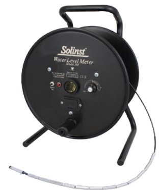
Model 102 P1 Water Level Meter

Sampling may be performed in open tubes using a Mini Inertial Pump, Micro Double Valve Pump, or a Peristaltic Pump.