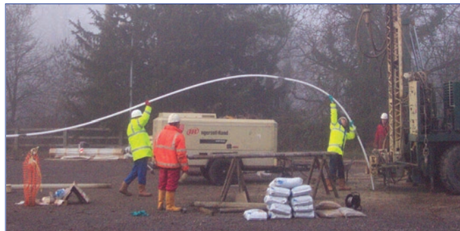
CMT Installation at UK Chlorinated Solvents Site

These cartridges are approximately 2.4" (61 mm) in diameter and will fit inside various direct push drill rods. Ideally, the borehole diameter these bentonite cartridges are used in should not exceed a nominal 3.5" (90 mm), to ensure proper expansion and sealing.