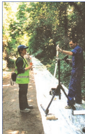
CMT System installed to a 60 m (200 ft) depth with seven monitoring zones. Installation was completed by placing layers of sand and bentonite to monitor a BTEX/MTBE plume in a Chalk aquifer, United Kingdom.