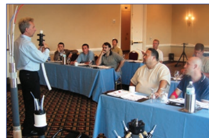
Instructing drilling contractors and consultants on CMT installation techniques at Battelle Bio-Symposium, Baltimore, Maryland.

Please contact Solinst should you wish to attend or set up a training session.