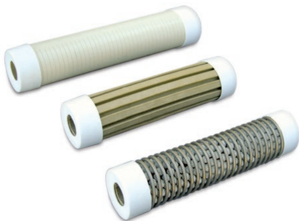
3-channel CMT Sand and Bentonite Cartridges

The CMT can be installed using standard sand and bentonite layers placed via a tremie pipe, or poured directly from the surface. The Model 103 Tag Line is ideal for accurate placement of sand and bentonite during borehole completion. If the installation is in loose sands, natural collapse can be used, allowing the sand to collapse around the tubing.