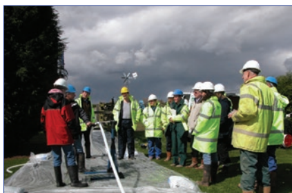
CMT Installation and training as part of a "Multilevel Course" given by the University of Cranfield at Silsoe, U.K., in conjunction with Waterra (UK), British Geological Survey & Norwest Holst.