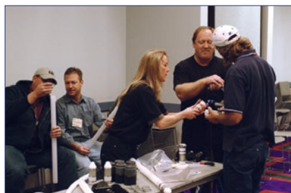
The first CMT contractor training course, conducted at the NGWA Expo in Las Vegas, December 2004. Contractors are being instructed on proper port construction.