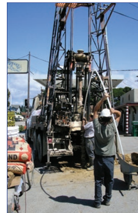
A gas station site in Watsonville, California. Five 3-Channel CMT Systems were installed to monitor gasoline contamination and MTBE plume. Installations were completed within hollow stem augers using bentonite and sand layers to isolate each monitoring zone.