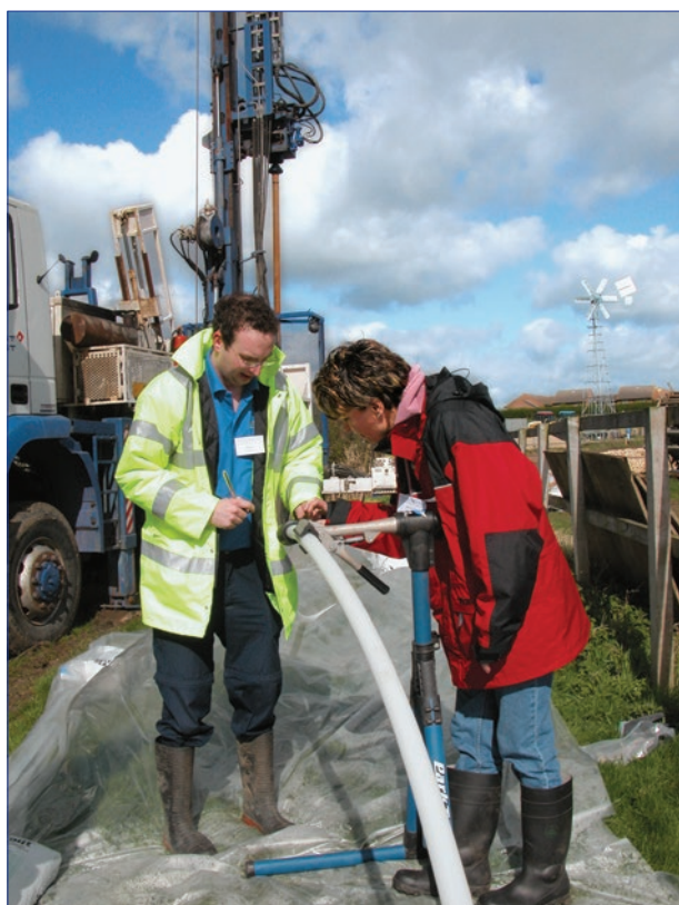
Construction of CMT ports in a 7-Channel system installed in Silsoe, England.

Two systems are available. The 1.7" (43 mm) OD polyethylene tubing, segmented into seven channels, allows groundwater monitoring at up to 7 depth-discrete zones. The 3-Channel System uses the same material and construction, but it is only 1.1" (28 mm) in diameter. This narrow tube was developed for smaller diameter installations, especially direct push where the annulus for seal placement is narrow.