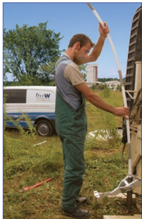
3-Channel CMT installation at a plant in Zeitz, Germany. Systems were completed using natural collapse and are being used to assess natural attenuation of BTEX.