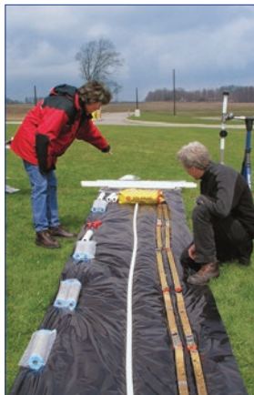
Installation of a 3-Channel CMT System with bentonite and sand cartridges. Three zones were monitored over a 20 ft (6 m) depth. The installation was completed in glacial till at the University of Waterloo, Ontario Canada.