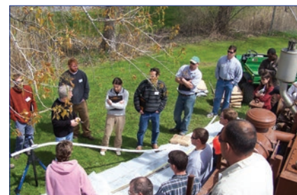
Outdoor installation/ demonstration at premises of Parrat-Wolff, Environmental and Geotechnical Drilling Services, Syracuse, New York.