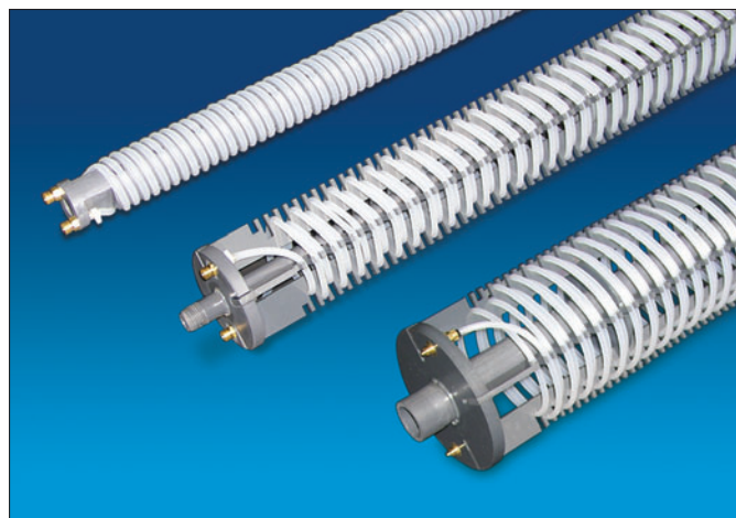
1.8", 3.8" & 5.8" Waterloo Emitters