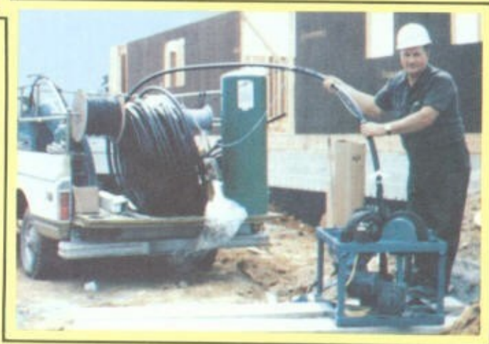
Installation of coil plastic pipe directly from service truck