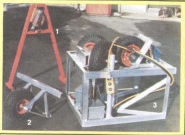
Left: Model 2010 Winch